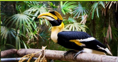
Bird Paradise Wildlife Park